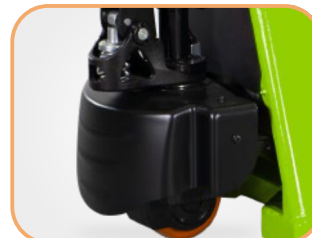
Protection cover Anti-foot stamping Protect the drive motor