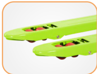
Tandem/Single PU wheel